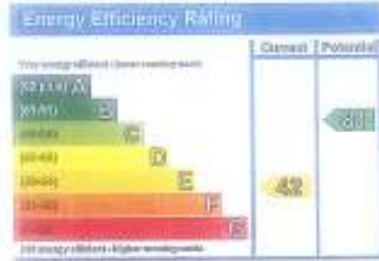
Flat 2, 48-50, Ridge Terrace, LEEDS, L86 ZDA