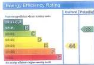
Flat 1, 48-50, Ridge Terrace, LEEDS, L86 ZDA