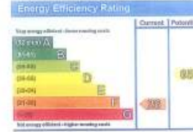
Flat 5, 48-50, Ridge Terrace, LEEDS, L86 ZDA