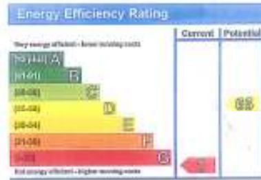
Flat 6, 48-50, Ridge Terrace, LEEDS, L86 ZDA